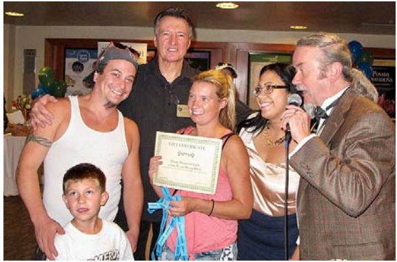
Prize winners at the 2018 Community Faire and Business Showcase.

We still have booths available for our yearly business trade show extravaganza. It will be held at the Luther Burbank Center for the Arts on September 26th from 4 – 8 PM. The Mark West Area Chamber Community Faire and Business Showcase is a great opportunity to show off your business and help support the Tubbs Fire rebuilding efforts. A portion of the silent auction proceeds will be donated to the Larkfield Resilience Fund. Last year we had nearly 1000 people attend this event. Come out,