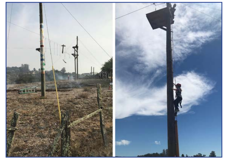
The 1,000 foot zipline at Cloverleaf Ranch is back in business! At left, the day after the fire. At right, its new reality today!