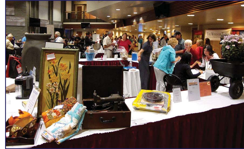
The 2015 Wine Courntry Harvest Faire and business Showcase featured a very active silent Auction (above). Don't miss this year's event! It promises to be every bit as fun and exciting, and there will be a greater variety of delicious free food!

There is also a silent auction where vou can bid on many useful items for a fraction of their normal price and a $200.00 Grand Prize raffle drawing. How can you go wrong?Exchange Bank has a wheel you can spin and win a prize every time and most of the other booths are giving out samples of their products or candy to all attendees. Please