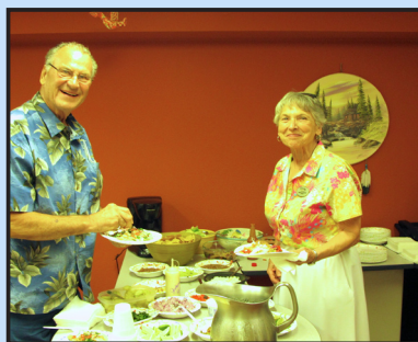
August Social hosted by Assets Insurance & Investments page 3

Support Your Chamber = Support Your Community!