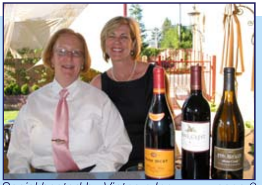
Social hosted by Vintners Inn