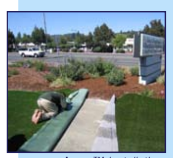
one lawn ™ installation

COMMUNITY BASED OUTPATIENT CLINIC EXPANSION & RELOCATION