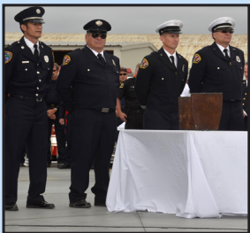
A piece of the World Trade Center