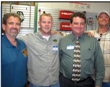
September Social hosted by California American Water & Aaction Rents page 3