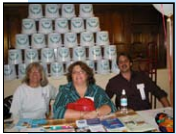
Tradeshow Sponsors Cal-Am Water