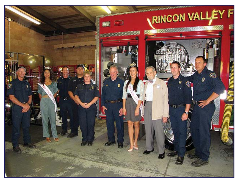
The crew of the fire station on Lark Center Drive hosted the Mark West Area Chamber of Commerce during an After Hours Business Social in June, 2014.

The Rincon Valley and Windsor fire districts created a joint powers authority in 2011 to manage both districts. This agreement allowed the management functions to be consolidated. The cost reduction