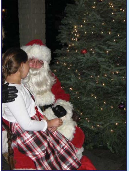
In 2013, Santa paid his usual visit to kids outside of Molsberry's Market. The tree was lit, and all was merry and bright. But when some Scrooge stole the tree, Kringles Korner Christmas Trees stepped up and donated a replacement!