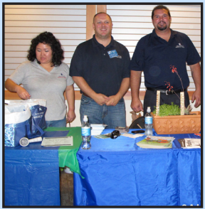
California American Water