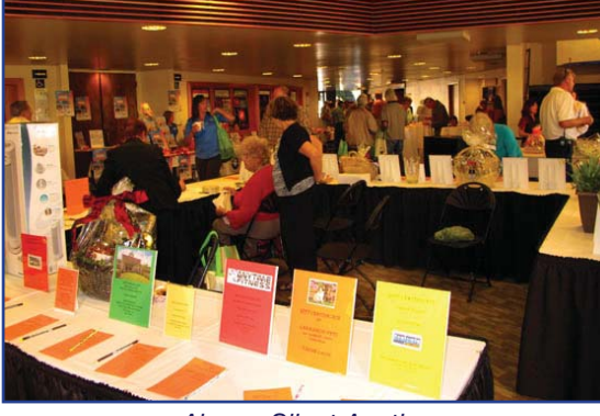
Above: Silent Auction Left: California American Water, Tradeshow sponsor Right: Molsberry Markets

November Social hosted by Anytime Fitness See page 3