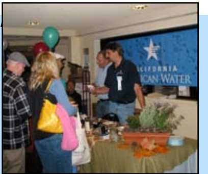
19th Harvest Faire & Business Showcase more on page 3

COMMUNITY CALENDAR AFTER HOURS BUSINESS SOCIAL Hosted by NORTH BAY CORPORATION