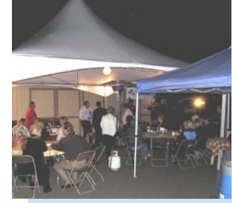
ready for anything!