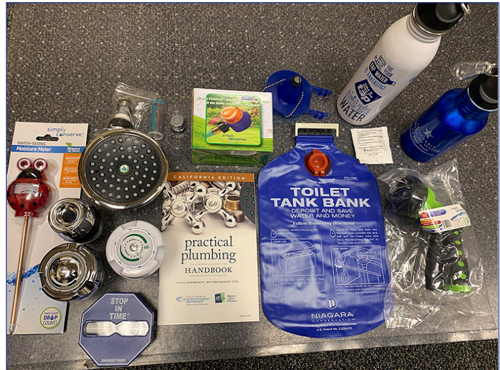
These are some of the water conservation devices available from California American Water.

Earlier in May, Sonoma Water's Water Advisory Committee, made up of local cities and water providers, called for a voluntary reduction in water use of 20 percent. We support this voluntary effort and have the tools and services available to help customers achieve this goal. In Larkfield, we have a balanced supply of locally pumped groundwater and water purchased from Sonoma Water. We don't anticipate a shortage in our water supplies, but it is important that we reduce water use to ensure the sustainability of our local ecosystems and prepare for the possibility of more dry years in the future.