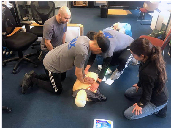
Students practice on the latest iteration of the CPR dummy at the Health First Training training center.