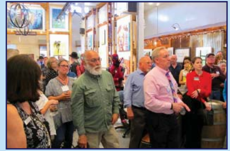
We had a good crowd at Fulton Crossing. The building is an old food processing plant, and its rebirth as an artisan center is a spectacular re-purposing of a property whose original role is no longer needed locally.