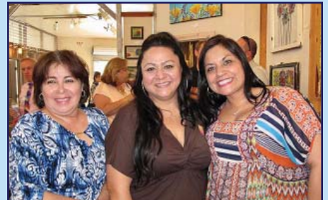
We had many familiar faces, and many we only seldom see, including members of the Windsor, Sonoma County Hispanic, Healdsburg, and North Bay Black Chambers of Commerce.