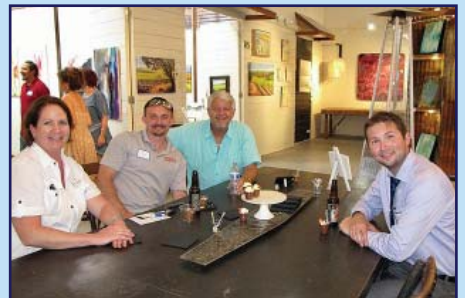
There was lots of visiting and camaraderie, and plenty of places to sit and enjoy the appetizers and wine provided by our gracious hosts. And all while surrounded by some of the best artwork in the county!