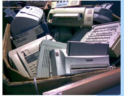
FYI: E-WASTE COLLECTION DRIVE