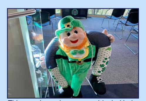
This guy showed up very suddenly, kind of like "poof" and he was there. He ran around a little, and disappeared. Just who he had draped over his shoulders we never found out. Very strange.