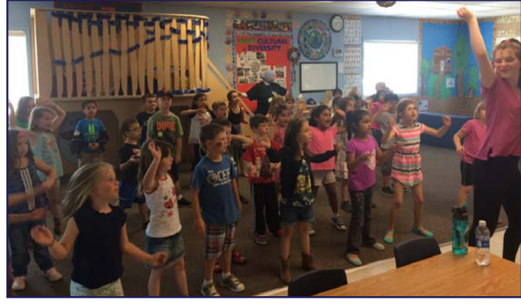
Extended Child Care is committed to assisting each school-age child in obtaining life skills by providing quality year-round learning programs, while supporting families and school districts. Their programs include after-school education, homework time, guided recreational activities, physical activities, and just plain fun!

Extended Child Care was founded in 1978 for the purpose of providing oncampus care for school-age children, both before and after school. Originally a subsidized organization for families in need, Extended Child Care soon had a shift in thinking that opened the doors to allow for private payment by families, while maintaining subsidized care for those in need. Now, covering the Mark West Union, Windsor Unified, and Wright school districts, Extended