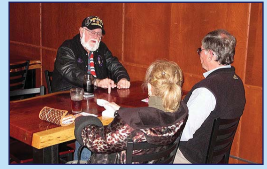
Chamber socials are a great place to make business connections. The decor of the Mark West Lodge bar is warm and inviting.