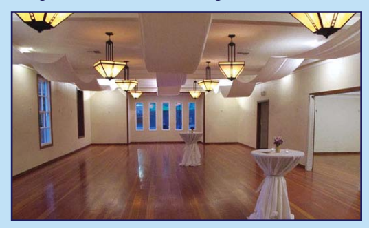
The Mark West Lodge has two large room that can be configured as meeting rooms, ballrooms, dining rooms... whatever you need.