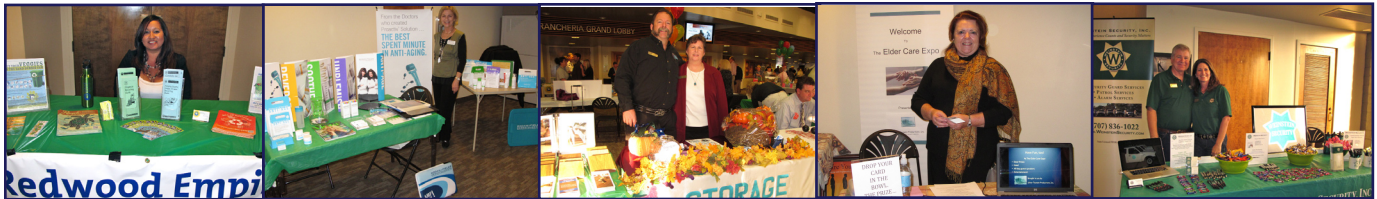
Redwood Empire Disposal