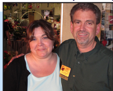
February Social hosted by Larkfield Florist & Gifts page 3