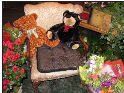
Larkfield Florist & Gifts was decorated for the holiday - always lovely!