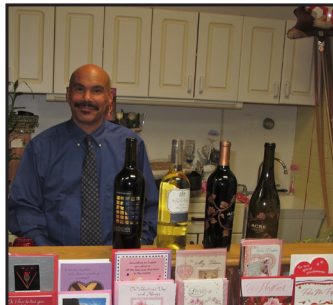
Missy provided a wonderful selection of wine & food

More photos @ MarkWest.org