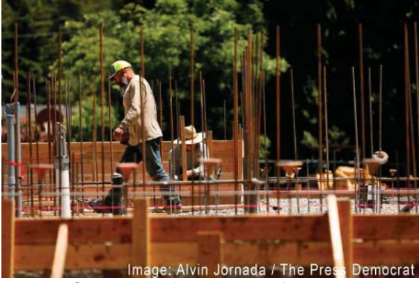
Construction in progress at Autocamp, a luxury camping facility near Guerneville