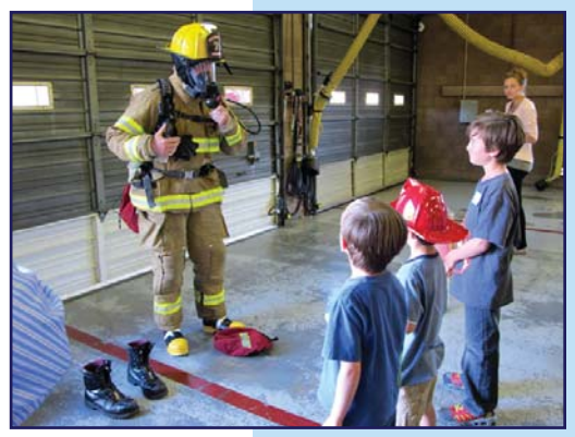
One of the fire fighters donned full fire gear (on that rather warm evening!) to show a rapt audience how it is done. We guess there was at least one future fire fighter in the crowd!