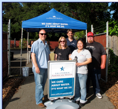
California American staff and crew