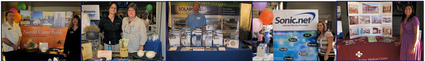
North Coast Bank