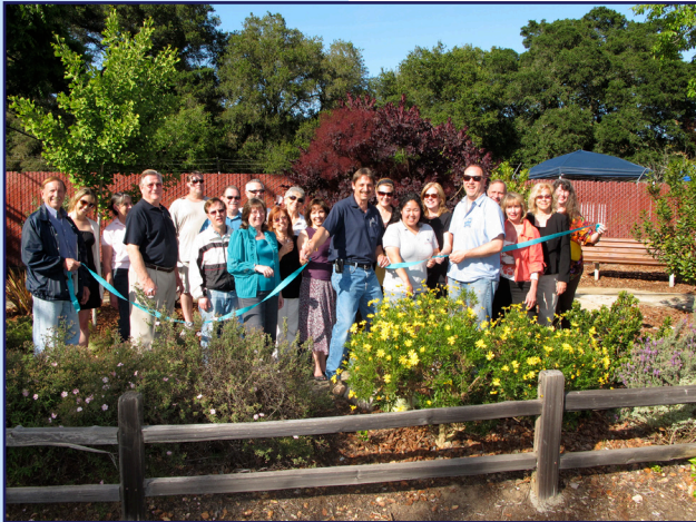
Members of the Chamber and community congratulate California American Water Company