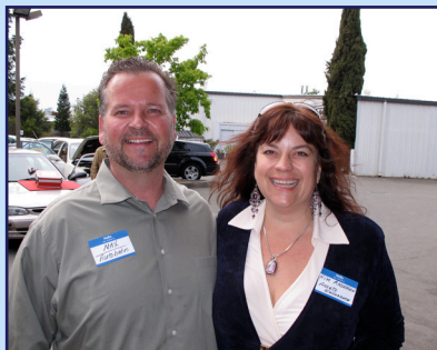
May Social hosted by Wikiup Tennis & Swim Club page 3

RSVP Now! at chamberee.org Only $5 for wine, food, museum tours and business networking!