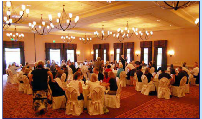
Members and guests enjoy our 2009 Installation Dinner