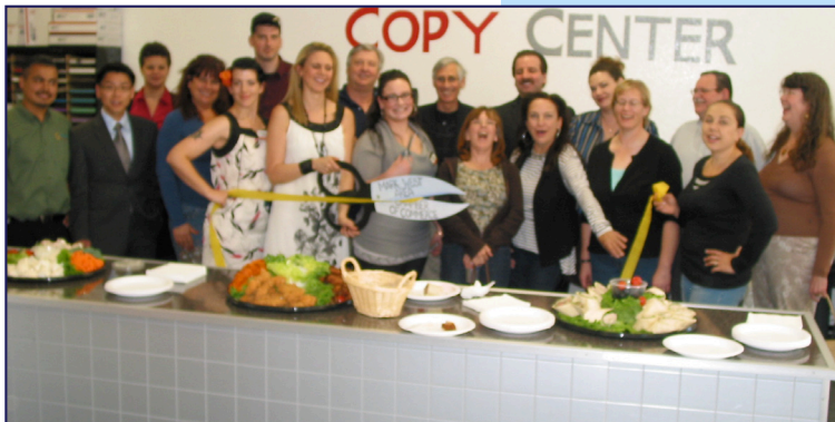
Business Copy Center celebrates their First Anniversary with a Ribbon Cutting