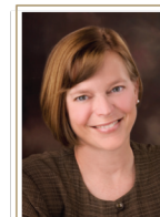
DRE Lic.# 01702360