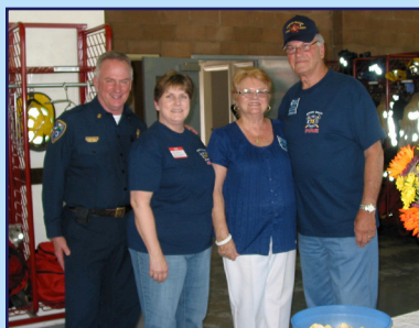
May Social hosted by Rincon Valley Fire District page 3

Cost is $40 per person / $75 per couple (includes gratuity and tax) No Host Bar