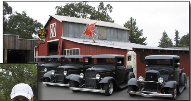
An award-winning collection of 1930's Ford pickups