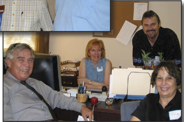
Staff & Associates of Golden Bear Financial