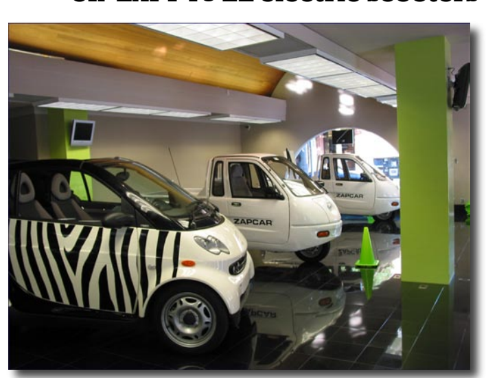
ZAP! Xebra and Xebra PK