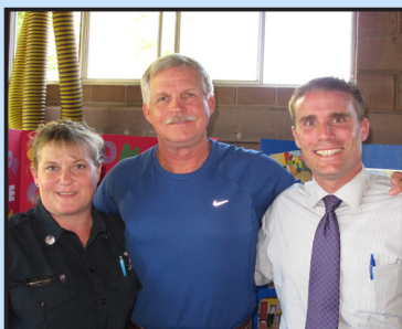
June Social hosted by Rincon Valley Fire District page 3