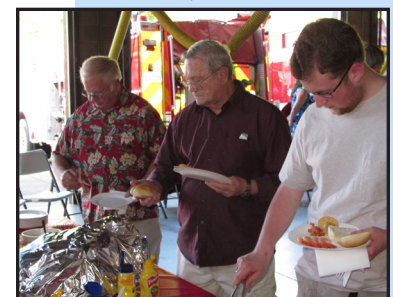
Members enjoy a delicious buffet provided by CFA

More photos @ MarkWest.org