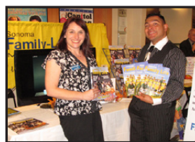
Sonoma Family Life