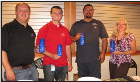
California American Water Show Sponsor

Your thoughts and prayers are greatly appreciated.