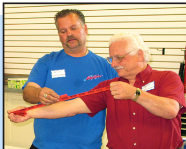
October Social hosted by AutoBahn Anything Detailing page 3