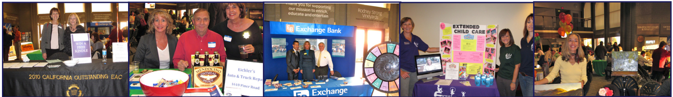
SC Employer Advisory Council