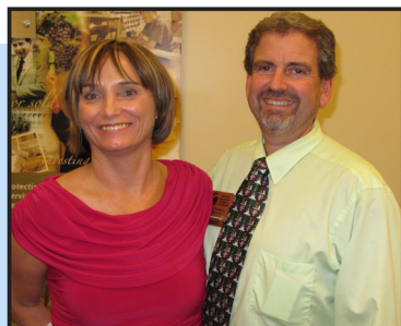
December Social hosted by Exchange Bank & Molsberry Markets, Inc. page 3