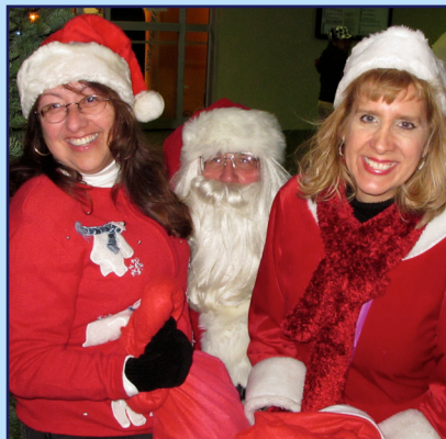
Santa and his elves at the 2010 Holiday Tree Lighting at Molsberry Markets, Larkfield Center