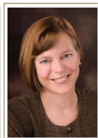
DRE Lic.# 01702360