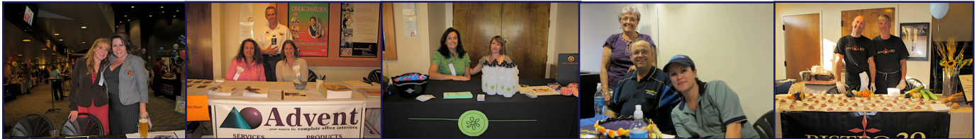
Advance Tech Collision