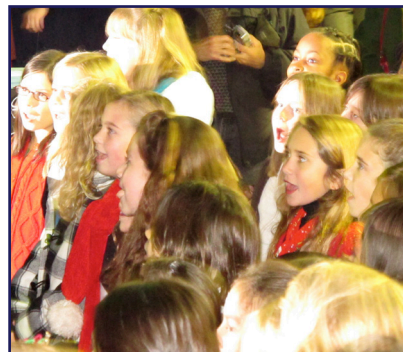
The Holiday Tree Lighting featured holiday carols by Mark West USD students & Santa!