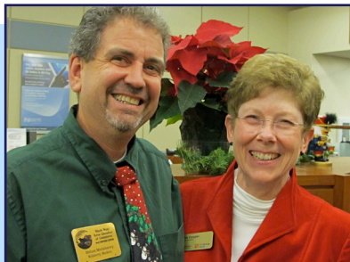
December Social hosted by Exchange Bank and Molsberry Markets, Inc. page 3