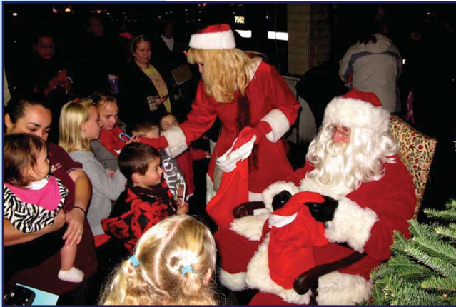
Santa arrived on a big red fire truck and was promptly enthroned near the entrance to Molsberry Market. He handed out sweet treats to the kids.

The annual Holiday Tree Lighting in December was a great success. Sponsored by the Mark West Area Chamber, Molsberry Markets, Inc., the Mark West Union School District, Larkfield Center, and the Central Fire Authority of Sonoma County, it took place Wednesday, December 4, 2013 outside Molsberry Market at Larkfield Center. Hot cocoa and cookies were generously provided by Molsberry Markets, which helped take the chill off and added to the holiday mood.