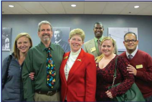
Our hosts from Exchange Bank and Molsberry Markets, Inc.