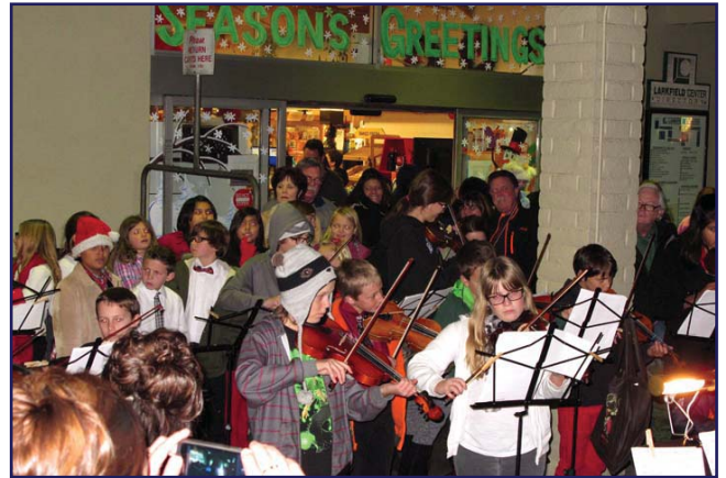
Students from the Mark West Union School District Music Program entertained one and all Above: Violins. Below: Chorus

We'd like to thank everyone involved for kicking off the 2013 holiday season in such fine fashion.