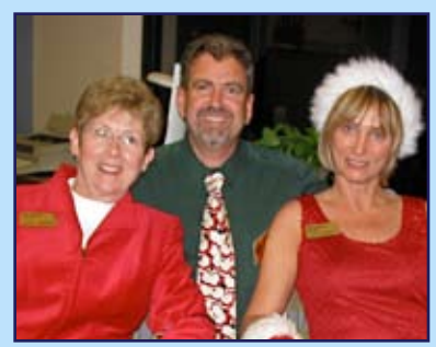
December Social hosted by Exchange Bank & Molsberry Markets, Inc. page 2