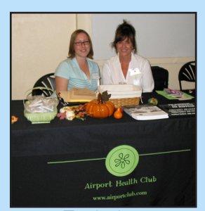
Tradeshow 2008 Airport Health Club

CALCHAMBER RELEASES LIST OF NEW LAWS AFFECTING CALIFORNIA BUSINESSES IN 2009