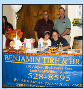
Tradeshow 2008 Benjamin Tire & Brake

CALCHAMBER RELEASES LIST OF NEW LAWS AFFECTING CALIFORNIA BUSINESSES IN 2009