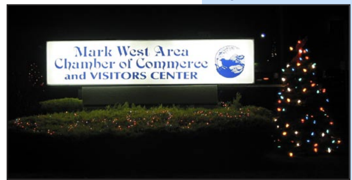
The Holiday Tree in front of the new Chamber Office.