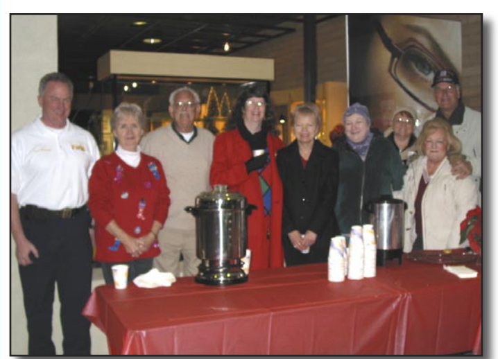
Chamber Volunteers at the Holiday Tree Lighting story & pictures on Page 4

The host provides a light buffet of appetizers and beverages for members and their guests to enjoy while networking. The Chamber Ambassadors introduce the hosts and gives them time to describe their business, products and/or services. Don't miss your chance to host a Social in 2007! Call 578-7975 or email markwest@markwest.org.