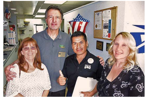
Socials, Ribbon Cuttings, and other Chamber events are a great way to make new business contacts.