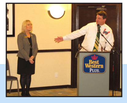
January Social hosted by Best Western Plus Wine Country Inn & Suites page 3