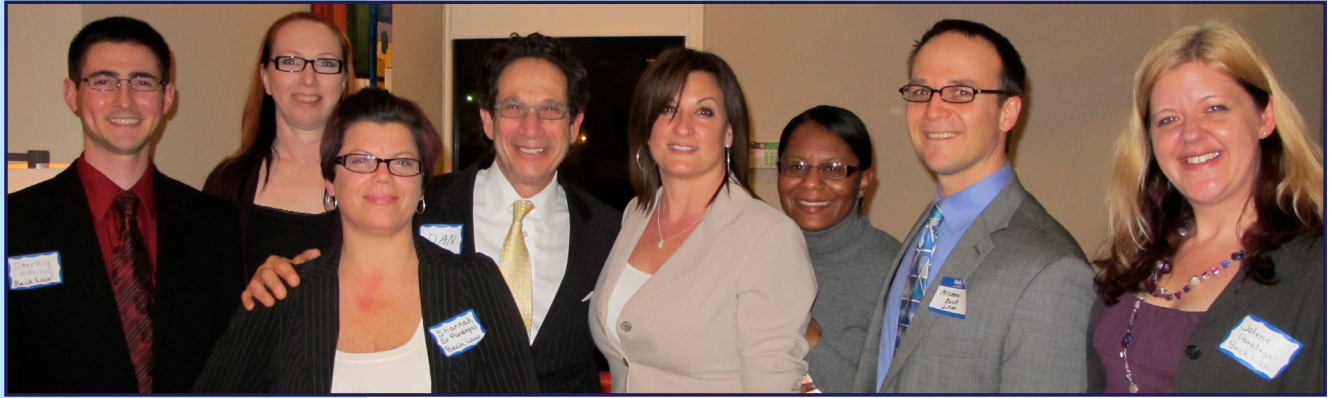
Beck Law, Inc.: