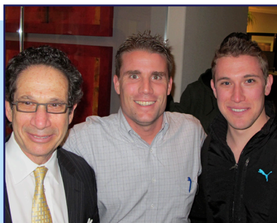
January Social hosted by Beck Law, Inc. page 3

We have office space available in the Chamber building on Old Redwood Hwy, across from Larkfield Center see page 2