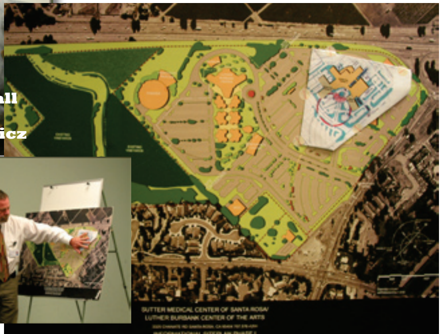
SUTTER MEDICAL CENTER OF SANTA ROSA LUTHER BURBANK CENTER OF THE ARTS SUTTER MEDICAL CENTER OF SANTA ROSA, CA 95628 INSPIRATIONAL STEPS AND PHASE 1