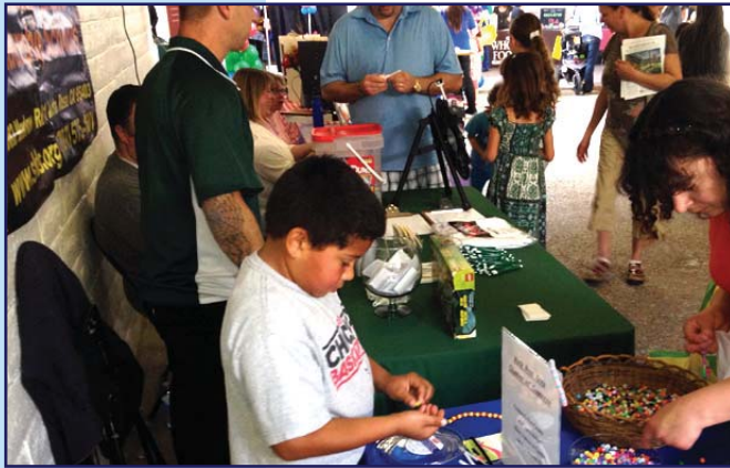
Many kids dropped by our table to indulge their creative sides and do some beading.

The Mark West Area Chamber recently participated in the Sonoma Family Life Magazine "ILearn" event held at the Wells Fargo Center of the Arts on January 25.