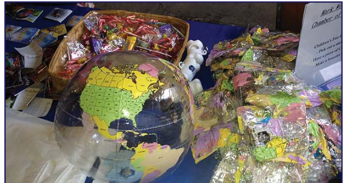
The Mark West Area Chamber gave away "globe" beach balls and small sweet treats in addition to the beading activities.

This great event is something all families should attend and next year's event is right around the corner. Sonoma Family Life Magazine hosts many events, and you'll want to check their website for exciting new events that they post all the time: www.sonomafamilylife.com .