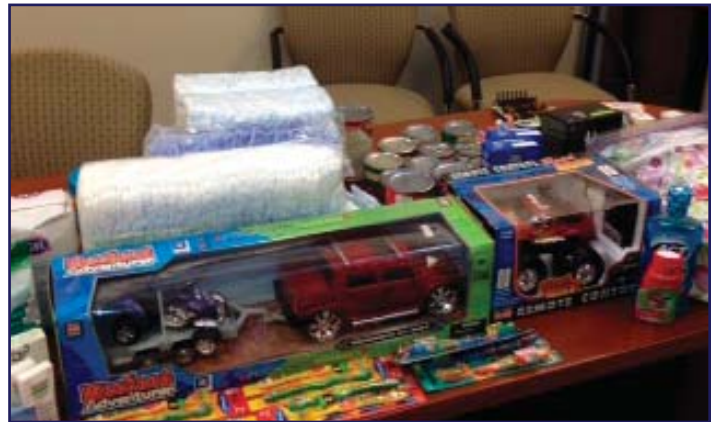
A few of the items collected during the Mark West Area Chamber's 2013 Holiday Charity Drive.