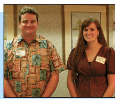
Social hosted by Holiday Inn Express more on page 3