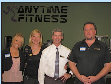
November Social hosted by Anytime Fitness page 3

We have office space available in the Chamber building on Old Redwood Hwy, across from Larkfield Center