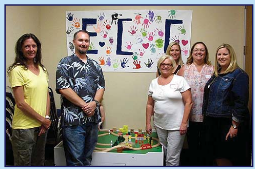
Some of the office staff and board members at Extended Child Care Coalition. A few of their regulars could not make it. They also employ several dozen teachers at schools throughout the region.