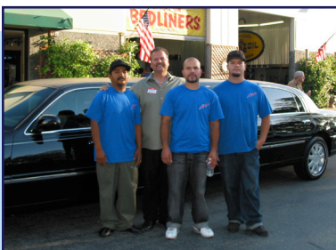
July Social hosted by AutoBahn page 3