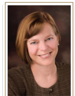
DRE Lic.# 01702360