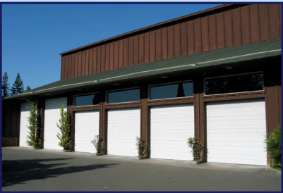
New location of AutoBahn 1675 Piner Road