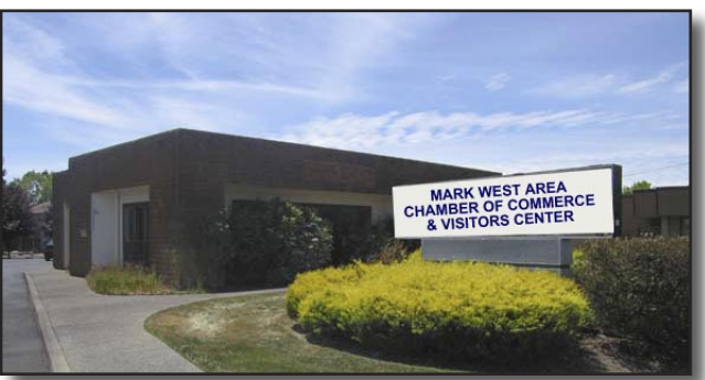
4787 Old Redwood Highway

Call the Office at 578-7975 or visit www.markwest.org.