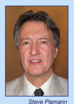
Aaction Rents President Our Mission: The Mark West Area Chamber of Commerce is organized to advance the economic wellbeing and uniqueness of the Mark West Area so that its citizens and all areas of its business community shall prosper.