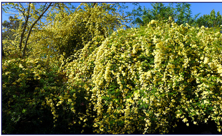
What an amazing springtime display! The trees are in leaf and the bushes are in bloom in our back yard.

We are not going into a one-plus-year pandemic, we are coming out of the pandemic. We aren't closing down businesses and social activities, we are opening everything back up! Not all at once, and larger indoor activities are still restricted. but not for long. And the Mark West Area Chamber is also opening up our monthly Socials. The first of our four or five monthly Socials will be at outdoor venues, but we are back and we will be