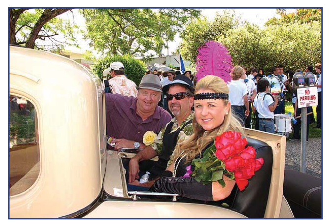
Mark West Area Chamber members get some fun, some exercise, and some promotion at the 2012 Rose Parade.

California American Water offers free rebates, home water surveys and more.