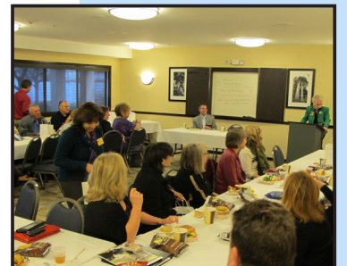
Members & guests enjoy an educational luncheon