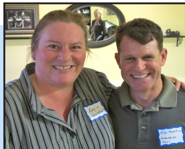
Marhc Social hosted by Recherche du Plaisir page 3