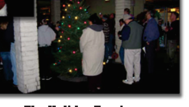
The Holiday Tree!